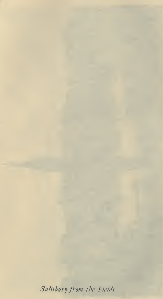
Salisbury from the Fields